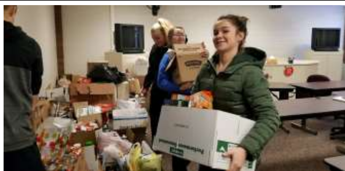
National Honor Society Members helping with loading the truck to the Hawkeye Harvest Food Bank